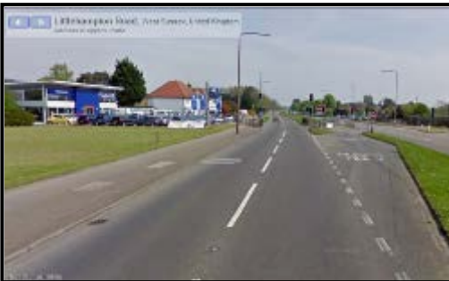
View travelling East on A259 Littlehampton Road – Peugeot Garage on LHS