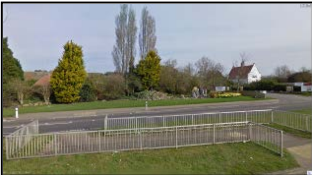
View North from pedestrian crossing point at HEA (ASLEC-HEMSA) offices entrance road