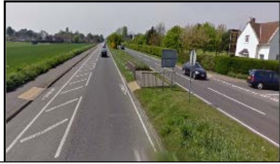
Pedestrian crossing point for Highdown Hotel – do not take this as there is no footpath on the west bound carriageway at this point