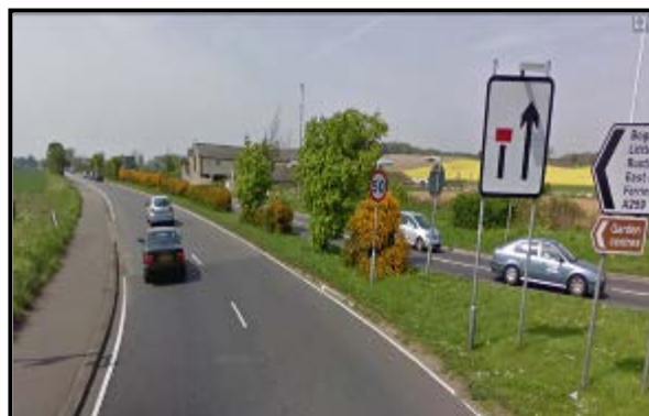
View along Littlehampton Road East bound