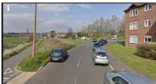
Take the footpath / cycle path on the LHS