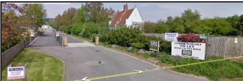
View approaching HEA (ASLEC-HEMSA) Offices – Keep to right hand approach - through brick pillars – (but on left hand side of this lane as it is a 2 way road). (Note: Premier House signs now replaced with signs with ASLEC HEMSA logos). Note also this is also a public right of way and bridle path, please keep to 5MPH speed limit.