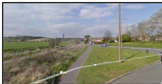
Carry on along the footpath / cycle joining Goring Street again