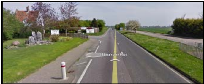
View turn to left to HEA (ASLEC-HEMSA) Offices (Note: Premier House signs now replaced with signs with ASLEC HEMSA logos)