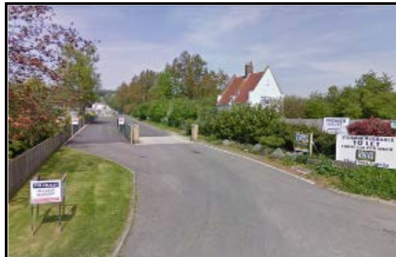
View approaching HEA (ASLEC-HEMSA) Offices = Use right hand approach - through brick pillars. (Note: Premier House signs now replaced with signs with ASLEC HEMSA logos).