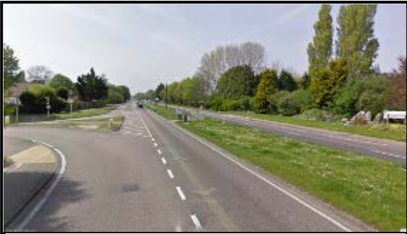
Littlehampton Road East bound j/w Ferring La (on LHS) – showing pedestrian crossing point to take on central reservation