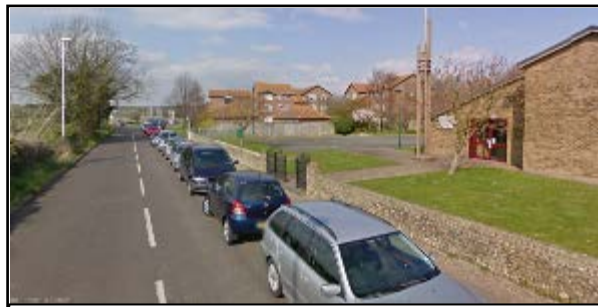
Walk North up Goring Street