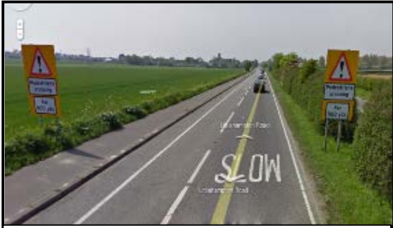
Littlehampton Road East bound showing signs for pedestrian crossing point for Highdown Hotel