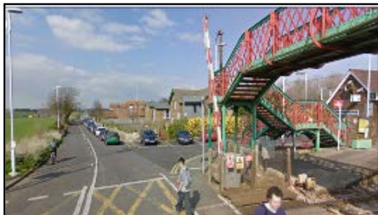
View from the station looking North