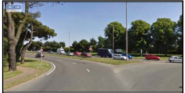
View entering A259 Littlehampton Rd East