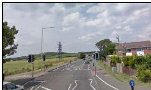
Proceed along Goring Street to the RAB at Littlehampton Road