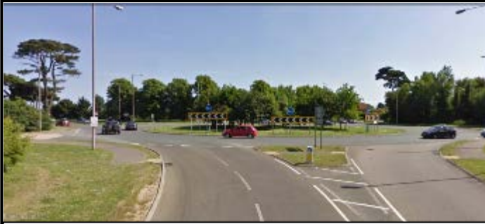
View approaching RAB from A280, towards A259 Littlehampton Rd East