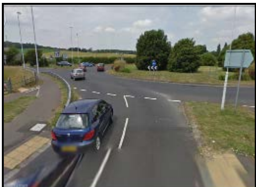
At the RAB with Littlehampton Road, take the left path along Littlehampton Road East bound