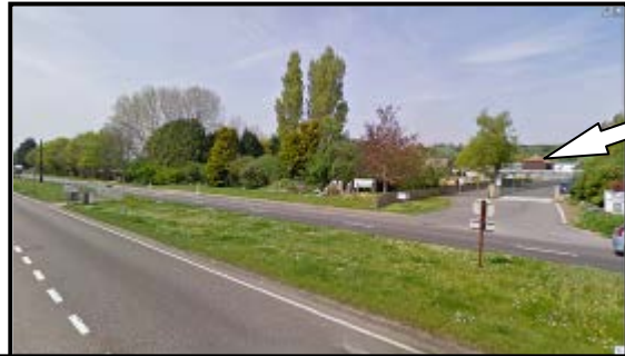
View North from same position as previous photograph – showing HEA (ASLEC-HEMSA) offices (arrow above)