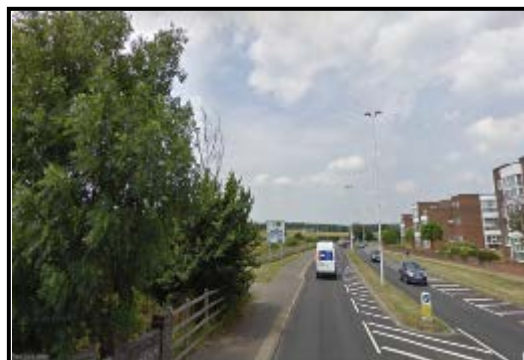
View along Goring Street approaching the RAB